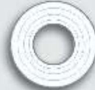
Typical cross-section of an NL Module