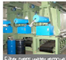
Filter press water removal