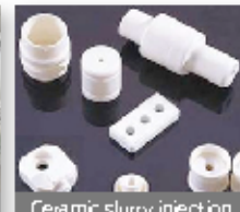
Ceramic slurry injection